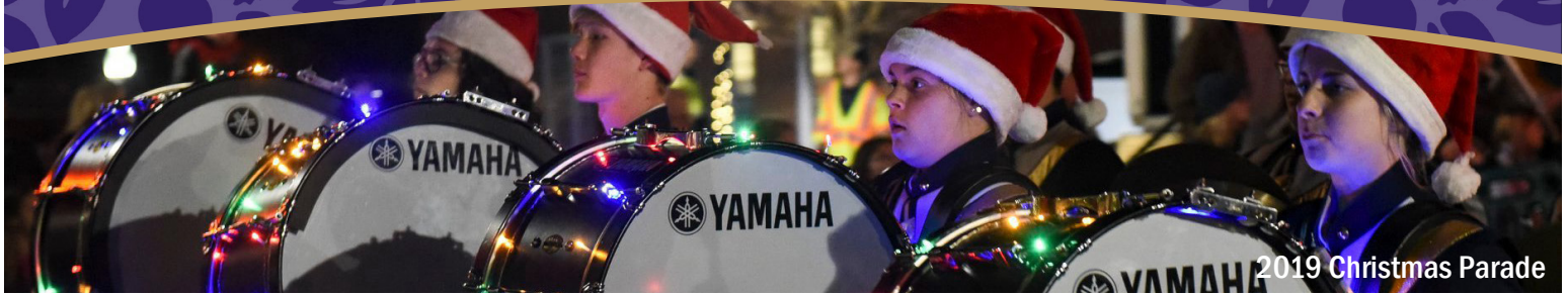
2019 Christmas Parade