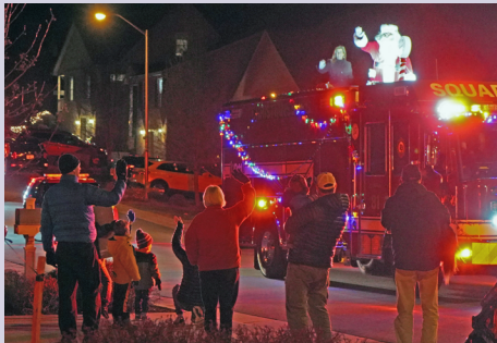
The Fire Department hosted Santa's Coming to Town for a third year.