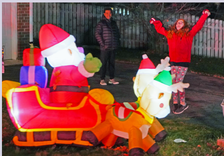
Santa spread holiday cheer throughout Christiansburg Dec. 13-17.