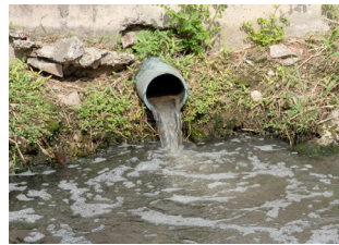
Christiansburg Industrial Park Stream Restoration and SWM Improvements Duration: Spring 2024-Fall 2024

this project is to reroute drainage that currently flows under existing buildings on Main St. while also relocating water and sewer lines on Hickok St.