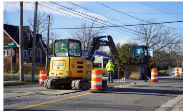
Waterline Replacement FY 2022-2023

park, an inclusive playground, an adult fitness zone, a challenge course, nearly two miles of trails, and green space for passive recreation.