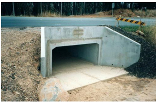
Hickok Street Storm Drainage Improvements Duration: Spring 2024-Fall 2025

Crews will construct a new box culvert on Hickok St. NW between First St. and Commerce St. NW. The ultimate goal of