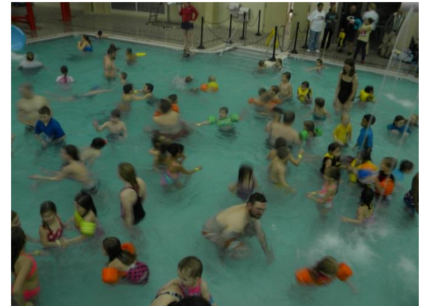
Christiansburg Primary PTA Night