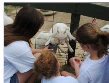
Buddies feed goats together at 5J Farm.

Campers participated in individual and small group activities in speech, language, fine and gross motor, and social skills development, along with field trips in the community.