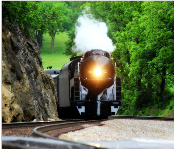
The 611 spotted near Chrisman Mill over Memorial Day weekend. Onlookers gathered in downtown Cambria during Depot Days to catch a glimpse.