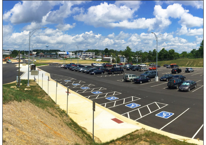
The Kenneth B. Gibson Memorial Park and Ride boasts new lighting, sidewalks, bike racks, bus shelters and parking spaces.

Where will you go first? Snap a photo and share it with us on Instagram or Twitter!