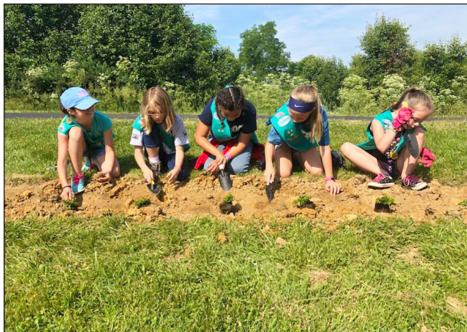
Girl Scouts from Troop 51 plant huckleberries along the Huckleberry Trail in June as part of a service project.