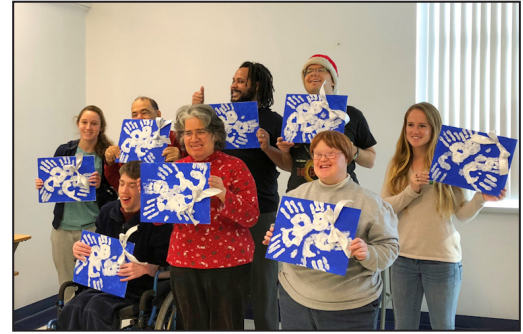
IDA clients and volunteers hold up their "friendship wreaths" in December 2018 at the last craft class of the year.