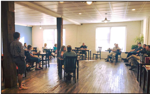
Residents and Town staff discuss initiatives during the first Coffee with the Mayor in August 2018.

Coffee with the Mayor, a monthly series aimed at generating conversations between Town staff, Town Council and residents, will return on March 9 at Great Road on Main. The event will begin at 9 a.m. and last about an hour. Complimentary coffee will be served.